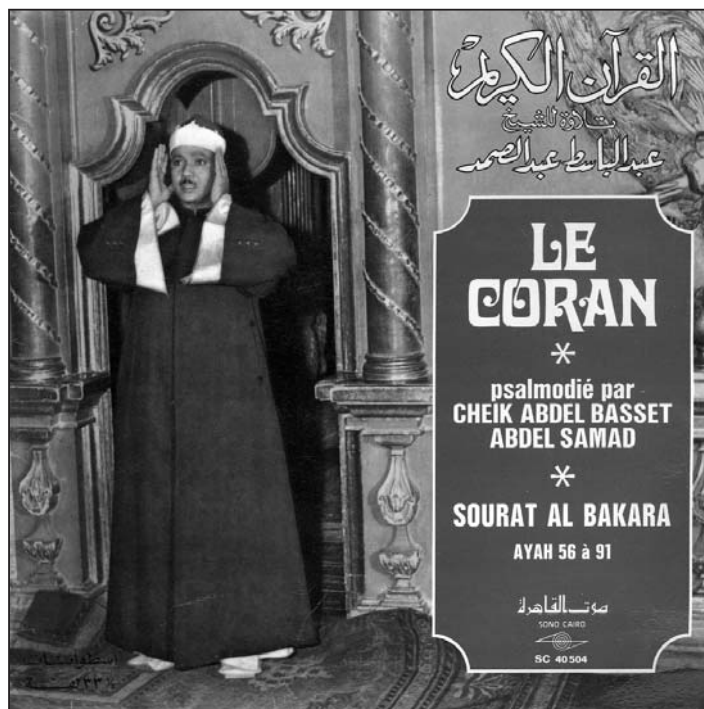
Fig. 3. Recording of Qur'an recitation distributed in Paris.

of spirituality, even of worship. It is a populist music, whose subaltern messages remain exposed, be they Islamist or ecstatically spiritual, as in popular Islam. It is their similarities to other European sacred musics that are most striking. For some Muslims, those similarities may resonate with traditional practices, such as the hajj to Mecca. For others, they may unleash the new instrumentaria that signal popular music styles as French, English, or European. Islam's radical otherness in the past reconciles itself to a no less radical sameness in the New Europe.