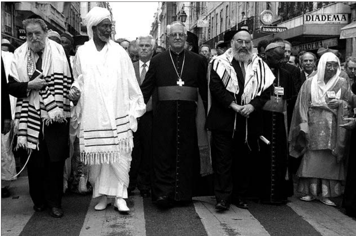
Top: Priests and monks of different religious march for peace in Lisbon, September 26, 2000.; bottom: Arab and Jewish men talk at a cafe on the Mount of Olives, Jerusalem.