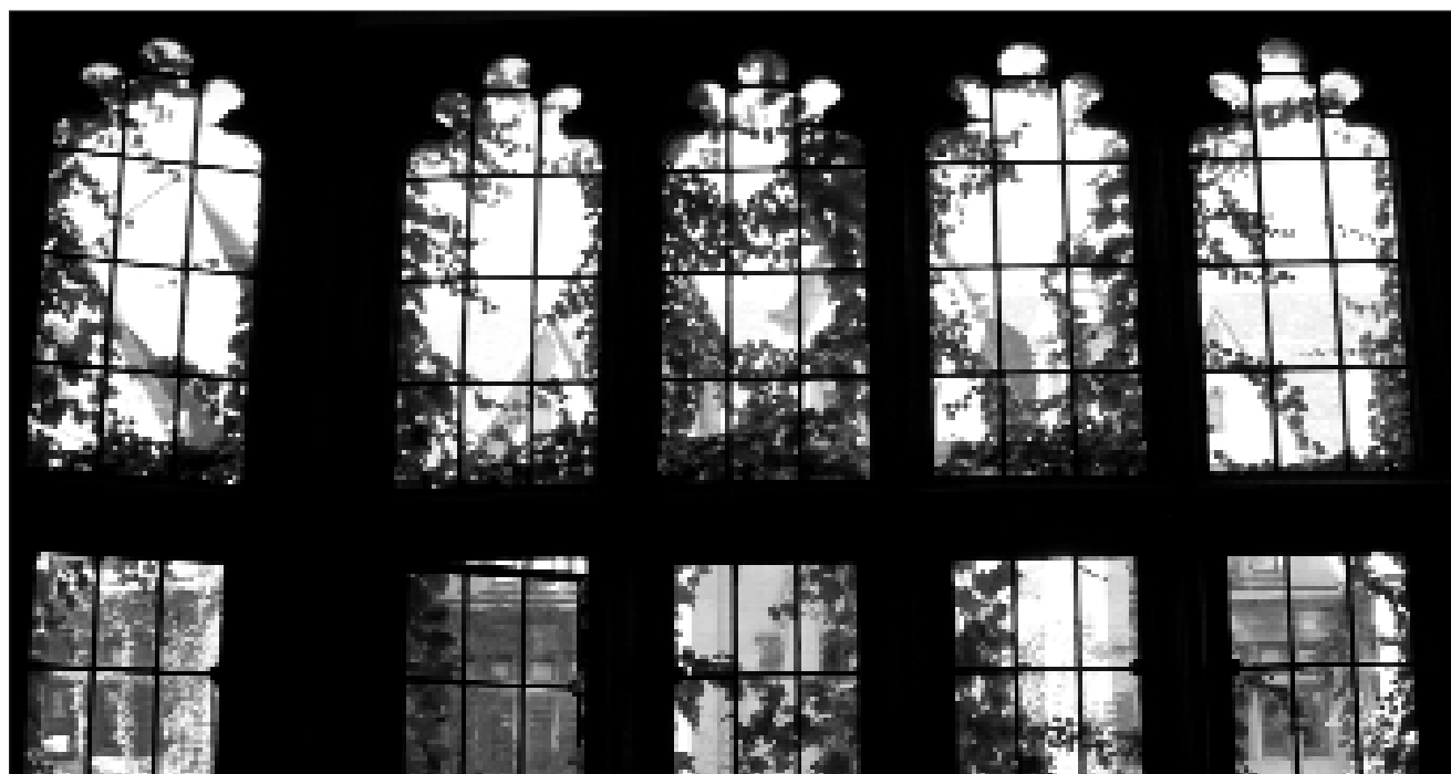
A view of Cobb Hall from the Howard Goodman Memorial Room in Swift Hall.