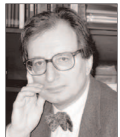
Jean-Luc Marion is John Nuveen Professor of the Philosophy of Religion and Theology in the Divinity School.