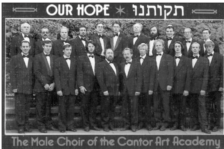
Fig. 1. Cover for audiocassette of music by the "Joint"-sponsored Male Choir of the Cantor Art Academy, Moscow.

The repertoires of the New European synagogue choruses vary considerably, one might even say wildly. They lay claim to the past, but rarely make an attempt to recuperate local community traditions—they do not demonstrate a concern for a community's minhag (local custom and convention)